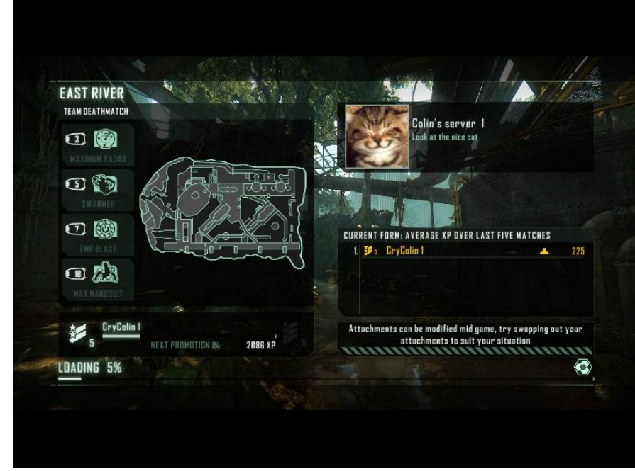
Server Info Screen showing MOTD and Server Image